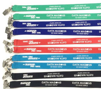
Lanyard 1 available € 3,000