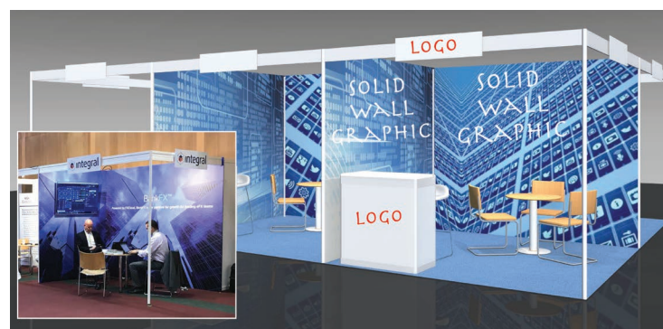
UPGRADE OPTION: PREMIUM GRAPHICS PACKAGE