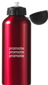
Water Bottle 1 available € 3,000