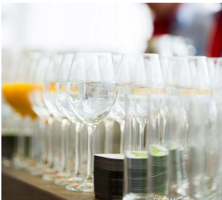
Beverage Station 2 available € 6,500