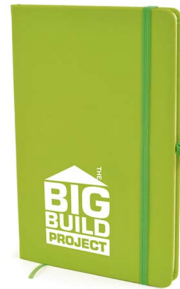
Note Pad 1 available € 3,000