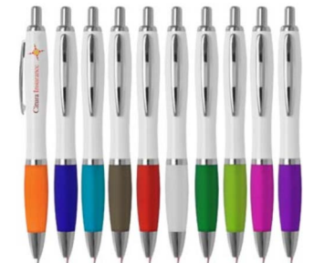
Pen 1 available €1,000