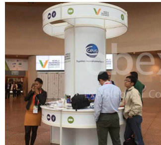
Charging Station 3 available € 5,000