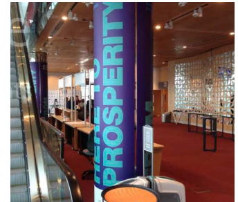
Column Wrap 4 available € 2,500